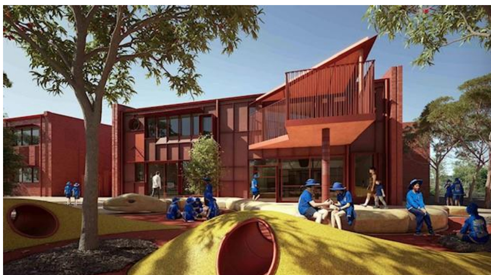
New STEAM centre – scheduled completion 2023

We value parent and family participation with involvement in many areas including classroom help in literacy and numeracy, sporting events, gardening, Parents and Friends Association and on sub committees such as Finance, SEL, Sustainability, Facilities and Planning, Curriculum and OSHC.