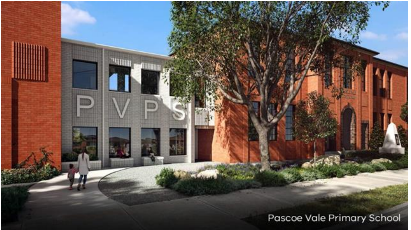
Pascoe Vale Primary School